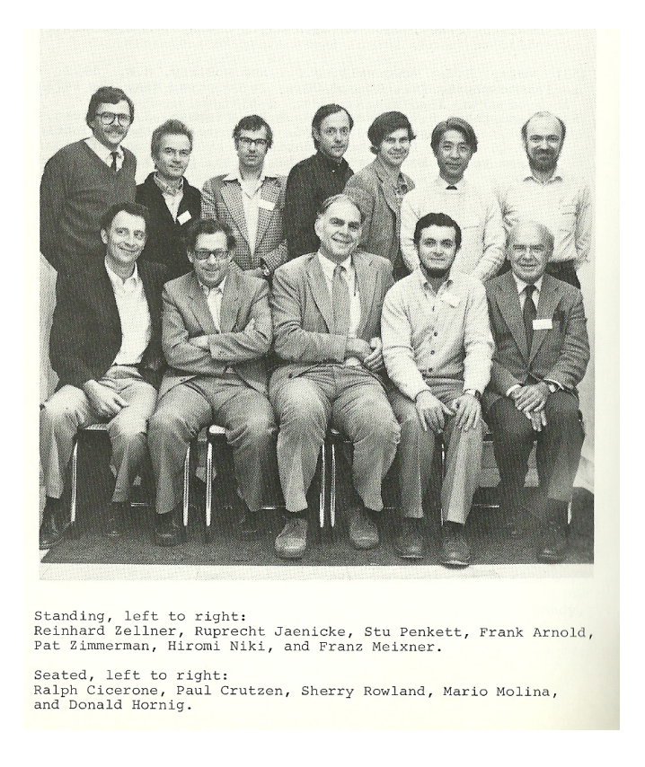
Figure 3. The Dahlem conference in 1982. Group on tropospheric aerosols and photochemical reactions. Participants as indicated on the image.