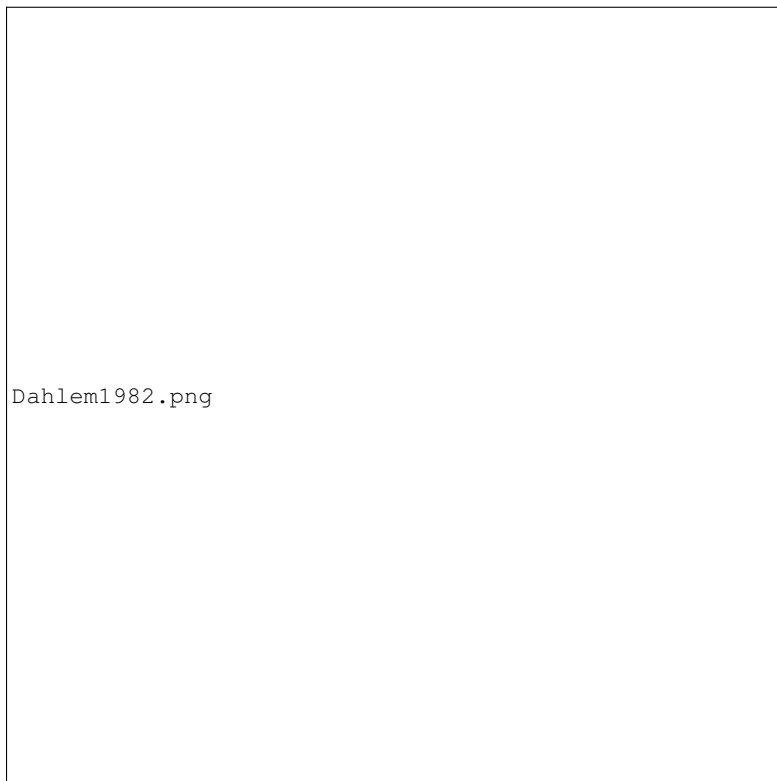
Figure 3. The Dahlem conference in 1982. Group on tropospheric aerosols and photochemical reactions. Participants as indicated on the image.

Ruprecht Jaenicke first met Paul Crutzen at conferences in the early 1970s. They also met at the well known “Dahlem conferences” in Berlin in the 1980s (Fig. 3). During Paul’s time at NCAR (section 2), Ruprecht was also visiting Boulder and was invited to Paul’s house in Boulder several times.