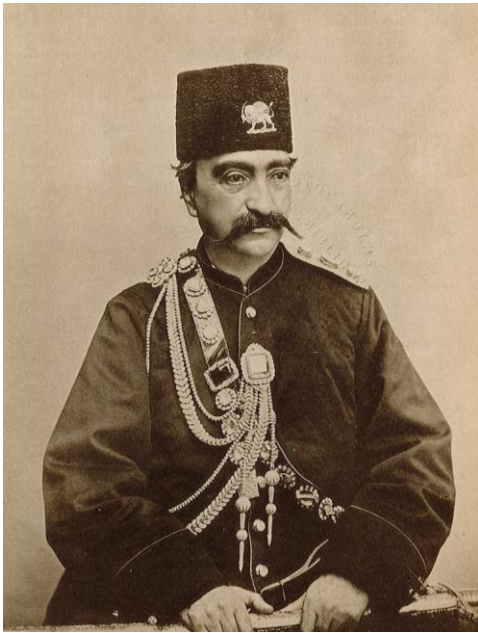
55 Figure 1: Naser al-Din Qajar, Shah, was the ruler of Persia at the time of the meteorite fall and received the stone in his palace and initiated investigations of it.