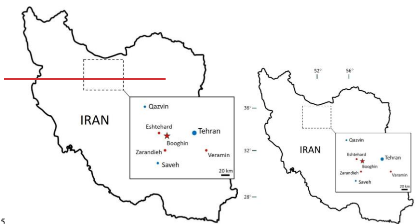
Figure 5. Map of Iran, with the key localities mentioned. The meteorite likely fell near Booghin, located nearly 100 km from Varamin (Veramin). Drawing by authors.