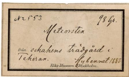
Figure 3. Original specimen label, Swedish Museum of Natural History, representing a part of one of the larger sample masses outside Iran. "Meteor stone from the gardens of the Shah in Tehran. Hybenette 1883". Reproduced from original archival document.

The most detailed description dealing with this meteorite was provided by the American geologist and meteorite collector Henry A. Ward (1834–1906), who travelled to Persia in an effort to see it and if possible, to obtain a specimen (Ward, 1899; 1901). Ward's interest came to be after having met Nordenskiöld in Stockholm in 1898, who had shown him a piece of the meteorite. He claimed that Nordenskiöld had received it "from a returned Swedish servant (barber) of the Shah". However, 105 according to specimen labels (Fig. 3) preserved at the Swedish Museum of Natural History, the source of the meteorite samples was Dr. Bertrand Hybenette (1846–1930), a Swedish dentist who for many years was employed as physician-in-ordinary to the Shah (Svenskt Biografiskt Lexikon, 1971). Hybenette had obviously passed on fragments of it to Nordenskiöld and the museum in Stockholm in 1883. According to Lindström (1884), the museum had in total 407 g of Veramin in its possession, listed as gift from the Shah of Persia. The mass available today is 347 g, arguably the second largest sample amount outside 110 Iran (cf. Grady, 2000).