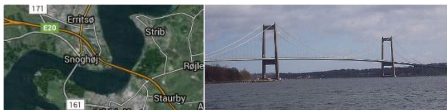
Figure 4. The highway bridge over Little Belt

In his spare time, and with permission from the Danish Railways, Bjerrum studied the stability of 80 railway embankments in various parts of Denmark where the ground conditions were difficult, enabling him to gather the first data for his subsequent doctoral thesis. Bjerrum was interested in the Jutland main line and, in particular, in a section along the Vejle Fjord, with scarps about 50 metres high in Tertiary micaceous clays; this was an extremely unstable area that had caused many problems for the Danish Railways (DSB) over the years.