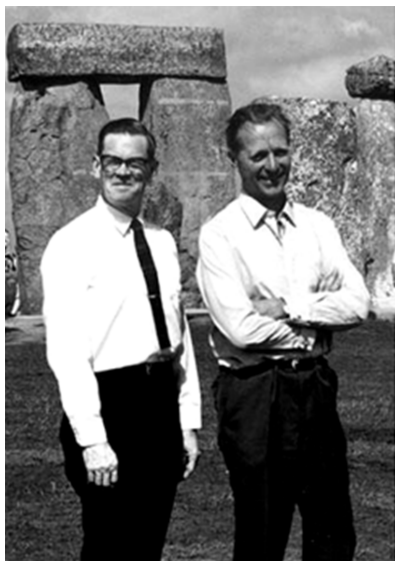
440 Figure 11. Ralph Peck (56) and Laurits Bjerrum (50) during a visit to Stonehenge, England, in 1968, coinciding with a meeting on the Dead Sea Dyke, (Guillán Llorente, 2015)

from mine ". In this paper Bjerrum laid the foundation for understanding the shear strength of overconsolidated clays and overconsolidated clay shales (Bjerrum, 1967).