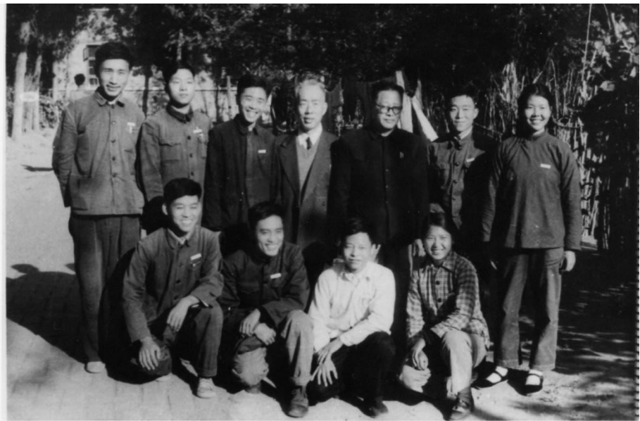
Figure 4. In 1964, Jeou-jang Jaw and Ganchang Wang took a group photo with the first geophysics graduates at the University of Science and Technology of China.