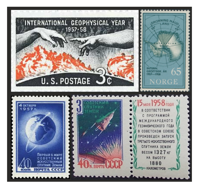
Figure 2. Stamps dedicated to the IGY and produced by the USA (the upper left stamp), Norway (the upper right stamp), and the Soviet Union. The texts in Russian of the Soviet stamps read "The pioneer artificial Earth satellite launched by the Soviet Union" (the lower left panel) and "According to the International Geophysical Year program, the Soviet Union launched on 15 May 1958 the third artificial Earth satellite of 1327 kg to a height of 1880 km" (the lower right panel). The images of the stamps are from the Internet (https://www.mysticstamp. com/Products/United-States/1107/USA/T1\textbackslash#, https: //colnect.com/es/stamps/stamp/48850-International_Geophysical_ Year-International_Geophysical_Year-Noruega, https: //en.wikipedia.org/wiki/Sputnik_1\T1\textbackslash#/media/File: Sputnik-stamp-ussr.jpg, and https://zvonmoneta.ru/mark-2586, last access: 30 January 2019).

satellite program to place instruments in Earth orbit (Sullivan, 1961).