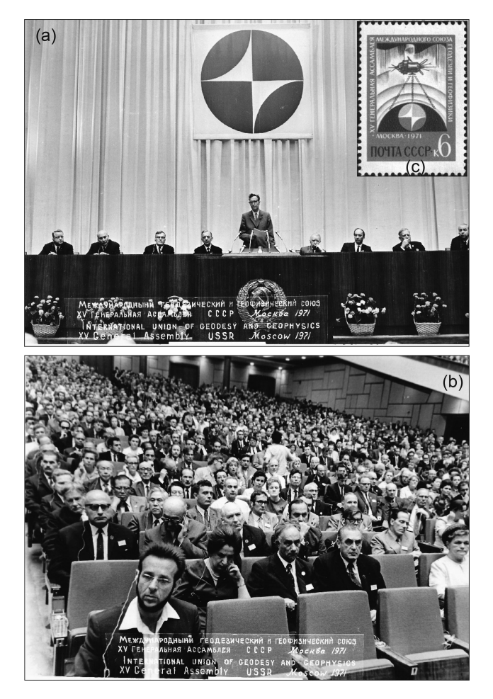
Figure 4. XV General Assembly in Moscow, USSR. (a) Opening ceremony and (b) delegates attending the ceremony in the Kremlin Congress Palace Hall (photos a and b: courtesy of Alik Ismail-Zadeh). (c) The USSR produced a stamp on the occasion of the IUGG General Assembly (photo: https://commons.wikimedia.org/wiki/File:The_Soviet_Union_ 1971_CPA_4005_stamp_(Satellite_over_Globe).jpg, last access: 30 January 2019).

The Union established a Working Group on Advice to Developing Countries, to coordinate with the ICSU Committee on Science and Technology in Developing Countries (COSTED). A new Union Committee on Geochemistry found support. Because considerable progress had been made in the understanding of hydrological processes, IASH became IAHS ("Hydrological Sciences" instead of "Scientific Hydrology"); its Statutes and By-laws were revised and its scientific structure was reorganized. The inter-Association Committee on Mathematical Geophysics (CMG) was established at this General Assembly. It originated with the former Upper Mantle Committee's Working Group on Geophysical Theory and Computers. The CMG, under the leadership of Vladimir I. Keilis-Borok, continued to organize symposia such as the eight annual symposia on geophysical theory and