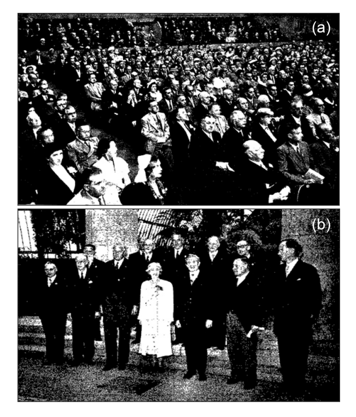
Figure 1. IX General Assembly of IUGG. (a) Opening Ceremony at the Palais des Beaux-Arts, Brussels. (b) Members of the IUGG Bureau, the Belgian National Committee for Geodesy and Geophysics, and the Association Presidents meeting H.M. Queen Elisabeth of Belgium at Château Royal de Laeken (Cox, 1951).

grams of the inter-governmental agencies, especially WMO. Its predecessor IMO was founded in 1873 to facilitate the exchange of weather information across national borders. WMO became a specialized agency of the United Nations in 1951 addressing areas of meteorology (weather and climate), operational hydrology, and related geophysical sciences. Relations between WMO and IUGG were formalized by the signing of a working agreement in 1953 whereby IUGG is recognized by WMO as the international forum for the advancement of meteorology while WMO is recognized by IUGG as having the primary responsibility for the international organization of meteorology. WMO and IUGG agreed to keep each other "advised of all developments and projected activities" within the WMO and IUGG fields of interest (WMO, 2002).